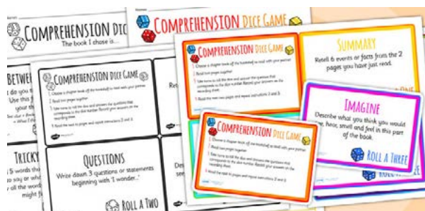
Comprehension Dice Activity